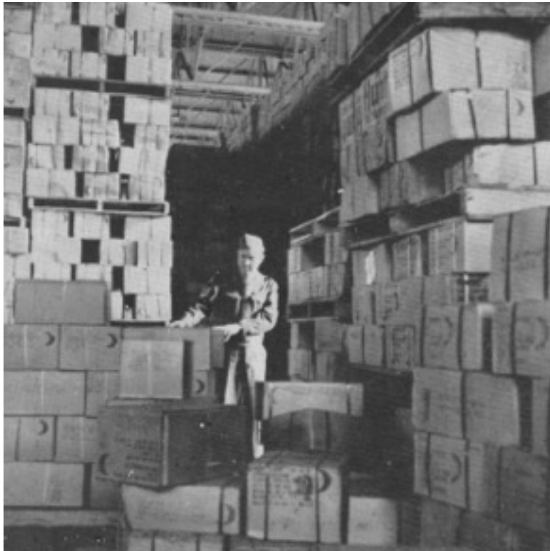
Warehouse 153, Sealand, Wales, 1954