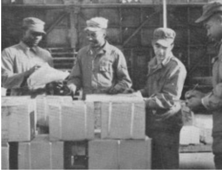
Shipping and Receiving, Sealand, Wales, 1954