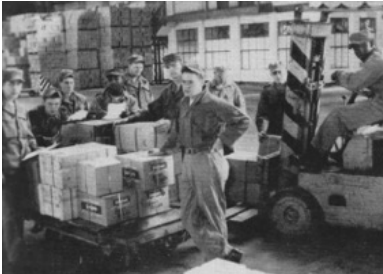
Warehouse 153, Sealand, Wales, 1954