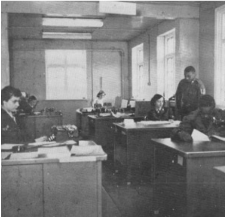
Stock Control, Sealand, Wales, 1954