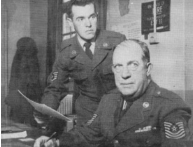
Orderly room, Sealand, Wales, 1954